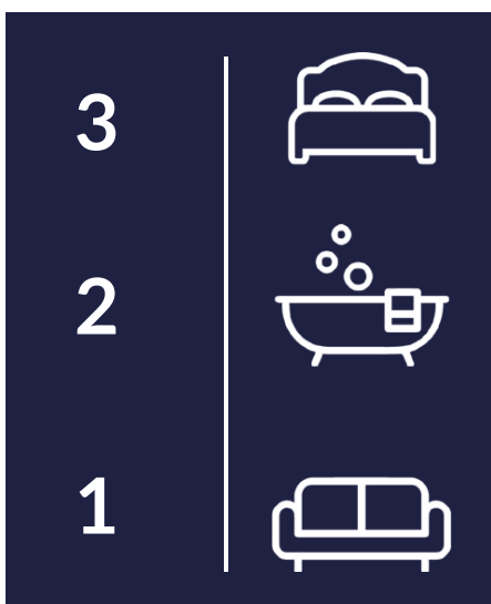
Illustration for identification purposes only. Not to scale. Floor Plan Drawn According To RICS Guidelines.